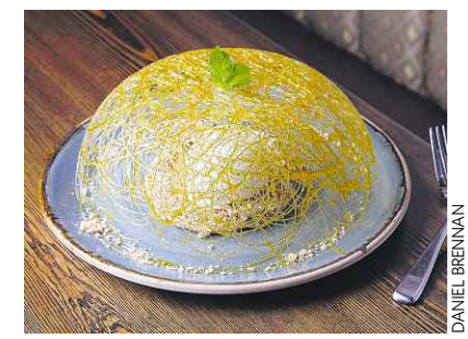
Apple tortada topped with ice cream under a golden caramel dome at Doma Land + Sea in Cedarhurst

Chef Stephan Bogardus succeeded the late Gerry Hayden at this lovely restaurant, and he has kept it the essential dining room between Riverhead and Orient. Subtle, seasonal and superb, it offers a balance of refinement and reverie. His six-course tasting menu is a memorable affair. Bogardus' hits go from white asparagus soup with rhubarb and crème fraîche to fish stew with lobster, cod and a saffron emulsion. Brussels sprout kimchi vies with chickpea hummus with ricotta salata. Risotto fritters are juiced up by lemon, Parmesan cheese and roasted garlic-black pepper aioli. Razor clams cooked in hazelnut oil add accents of coconut, blood orange and vanilla-black cardamom. Claudia Fleming's desserts, from her chocolate caramel tart to warm sugar-and-spice doughnuts, coconut tapioca with passion fruit sorbet to a coffee-toffee ice cream sandwich, are delectable. $$$-$$$$