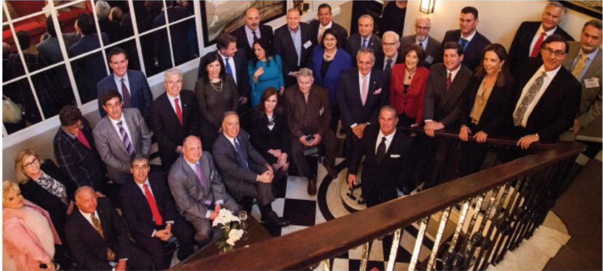
The 15th annual Long Island Press Power List honorees pose at The Mansion at Oyster Bay in Woodbury on Thursday, April 12, 2018.

Four hundred revelers packed The Mansion at Oyster Bay to celebrate the 15th annual Long Island Press Power List honoring the region's most influential business, nonprofit and political leaders on April 12.