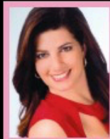
EMCEE & STAR OF STARS ANTOINETTE BIORDI News 12 Long Island