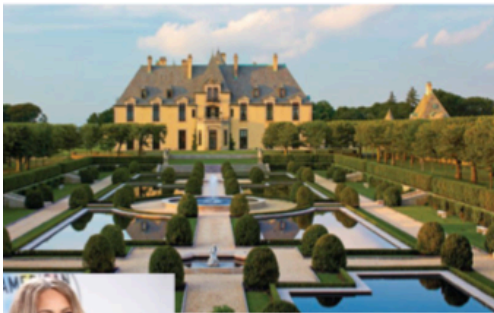
From top: The Oheka Castle; Mariah Carey is a native of Huntington.